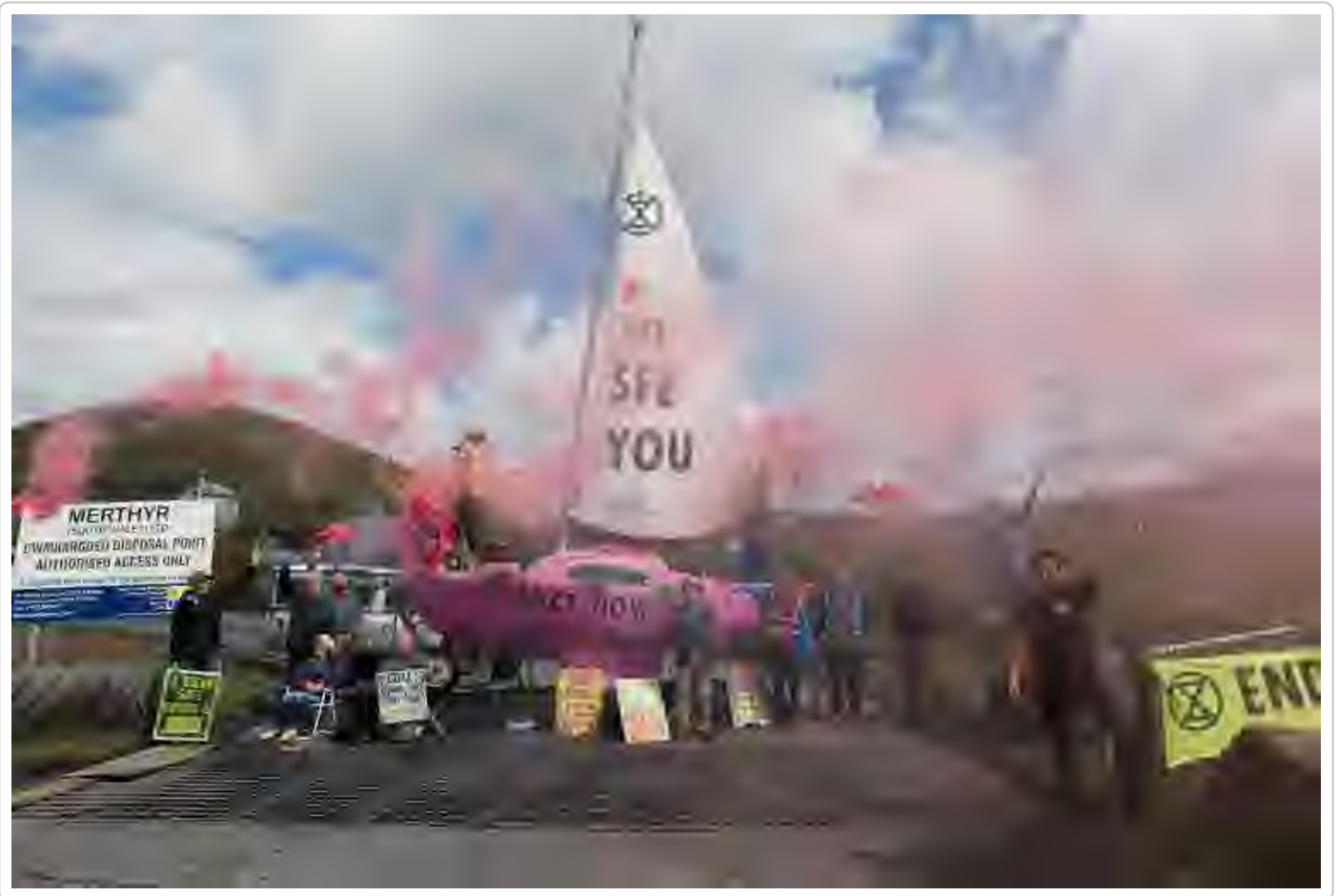
Blocking the entrance to the Ffos-y-Fran coal mine in Wales, July 2023.

Our actions were targeted, creative and everywhere.