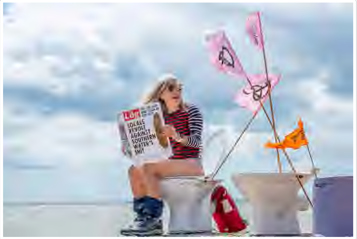
Protests about the dumping of raw sewage into our rivers have been happening all over the UK, with XR local groups collaborating with other NGOs and activist groups. One such protest took place in Hastings!

We called out the epic amounts of raw sewage being pumped into our rivers and seas, with family friendly acts of resistance. We saw thousands of people ‘Paint The Streets’ to make XR visible across the UK.